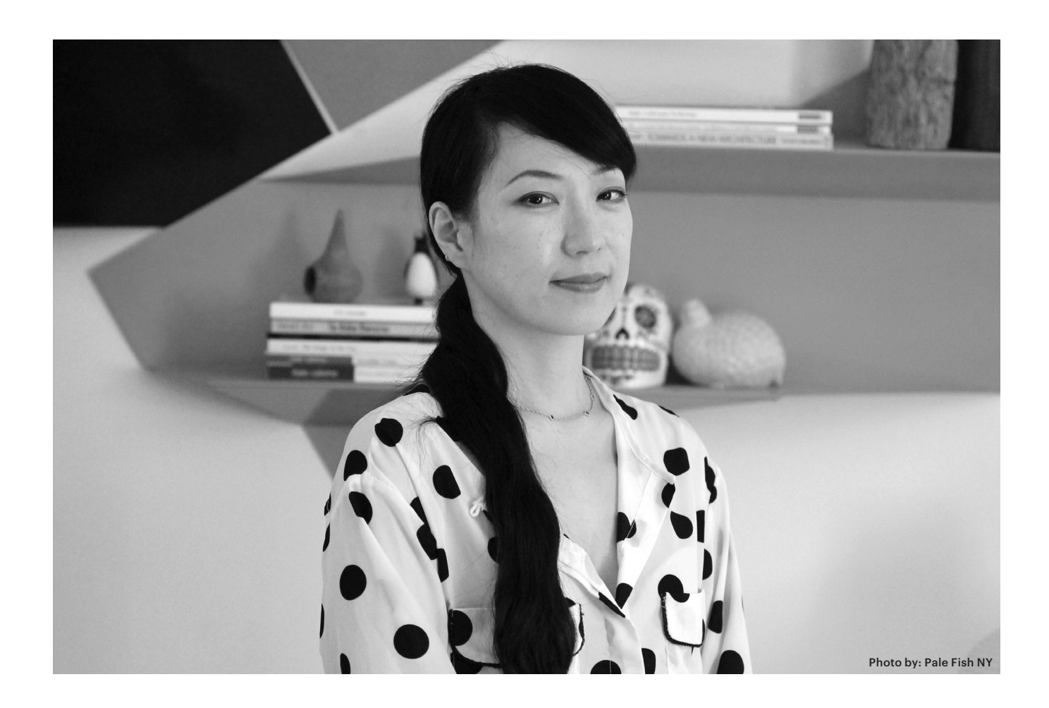
Soo Son of Pale Fish NY palefishny.etsy.com New Orleans, LA

"5 years ago I moved to New Orleans, my husband's hometown, and transitioned to jewelry design. I decided to open my shop up on Etsy because, practically, it allowed me to explore a new medium with low overhead and very low risk.